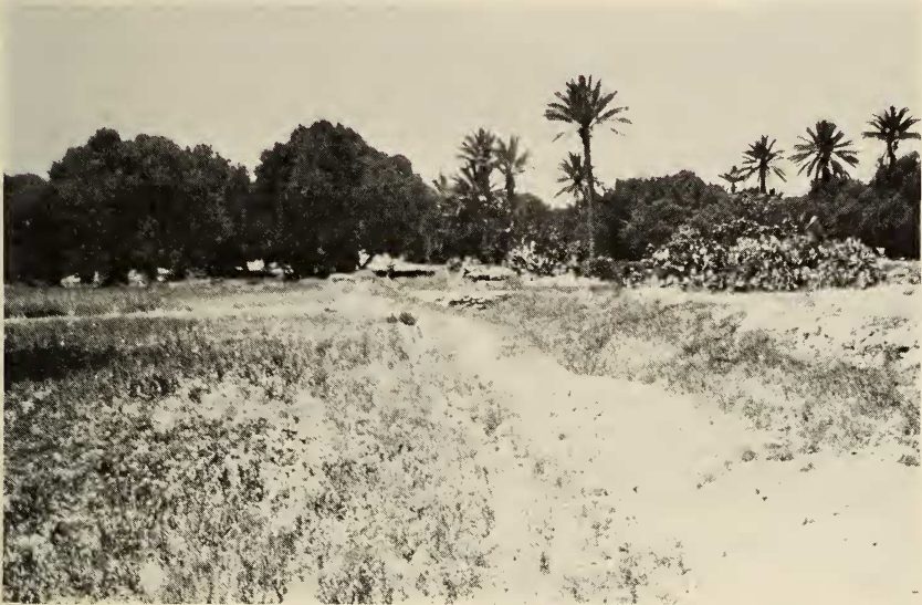
Fig. 2. Oasis near Tiznit, Anti Atlas (nr. 3 on the map), biotope of Elphinstonia charlonia DONZEL, Euchloe belemia ESPER, Zizeeria knysna TRIMEN etc.

Tafraoute, the temperature had risen to above 30°C and a firm wind was blowing. We stopped for a quick roadside lunch and saw many interesting skippers darting at the dry river bed at our feet while we were eating. Undoubtedly the most interesting of these was Spialia doris WALKER of which only very few specimens were caught. Carcharodus alceae ESPER was rather rare too but Spialia sertorius HOFFMANNSEGG was more common. In this locality a single Tomares ballus F. was caught together with some Melitaea phoebe DENIS & SCHIFFERMÜLLER, Anthocharis belia L. and Elphinstonia charlonia DONZEL. In a small Acacia tree we spotted some specimens of Azanus jesous GUÉRIN.